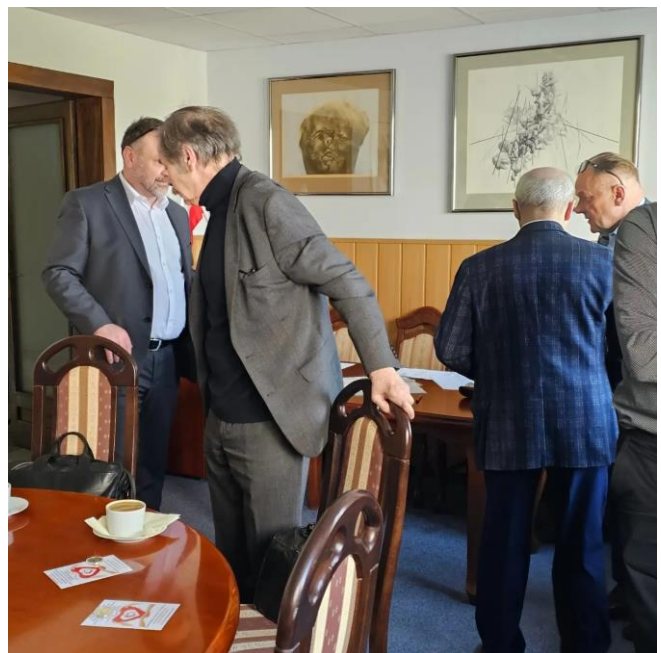
General Board Meeting.