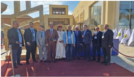
GASP conference, Hurghada 2023